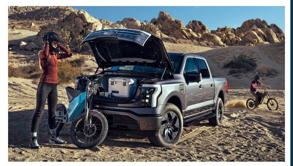
Ford F-150 Lightning